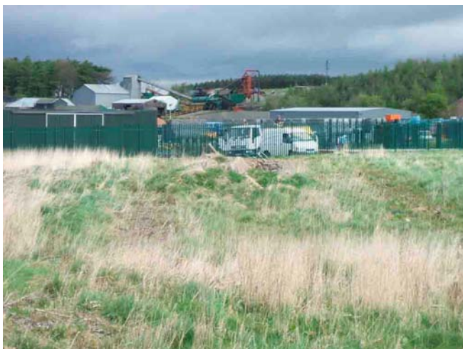
Oil depot - view eastwards along the trackbed from the main road. Eden's Officers tried to argue that this would not amount to an obstruction !