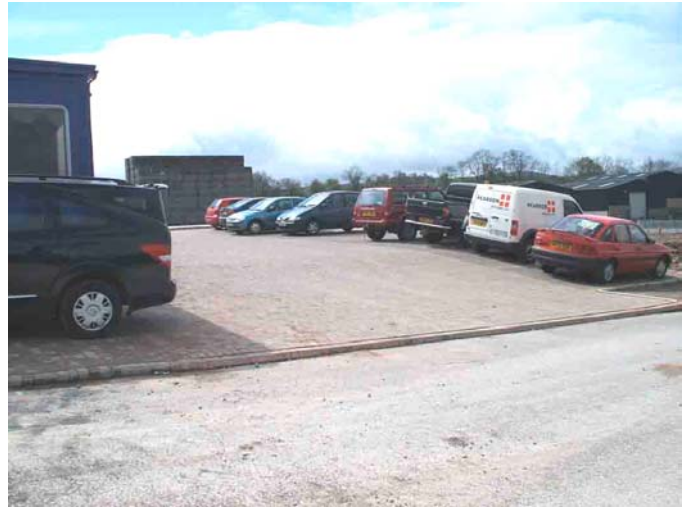
Trackbed west through block yard and car park. Ground levels have changed but there are no permanent buildings on the alignment.