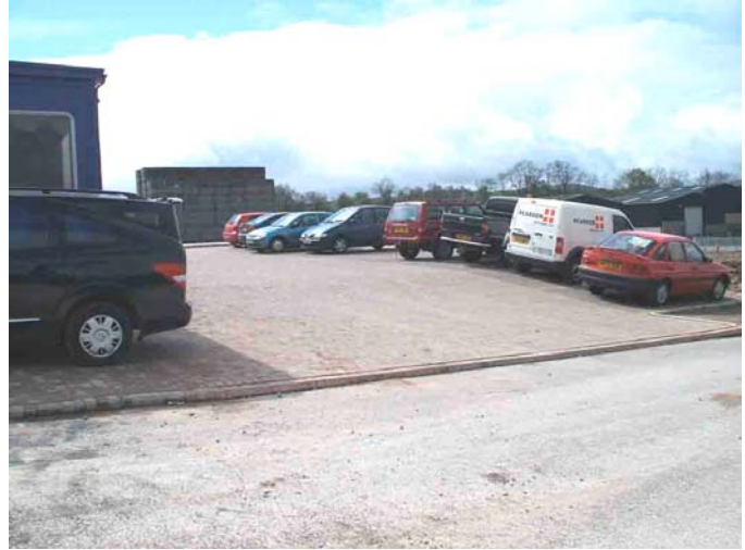
Trackbed west through block yard and car park. Ground levels have changed but there are no permanent buildings on the alignment.