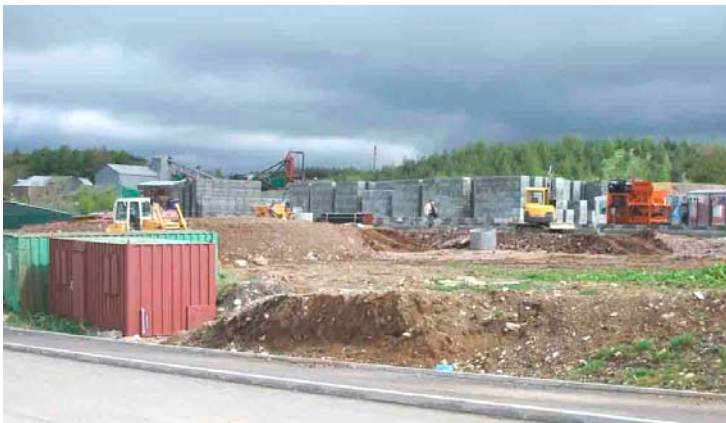
Trackbed east from oil depot to concrete works. Food warehouse site is to the left and does not obstruct the trackbed.