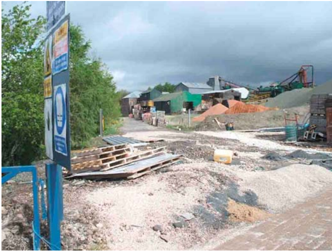
Trackbed east of the block yard, past the carbon works, towards Penrith. Untidy, perhaps, but not obstructed.

These photographs were taken on the 24th of April 2007. They are presented east to west (starting at the Penrith end of the site):