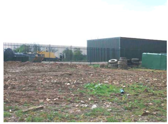
Oil depot - view westwards along trackbed alignment.